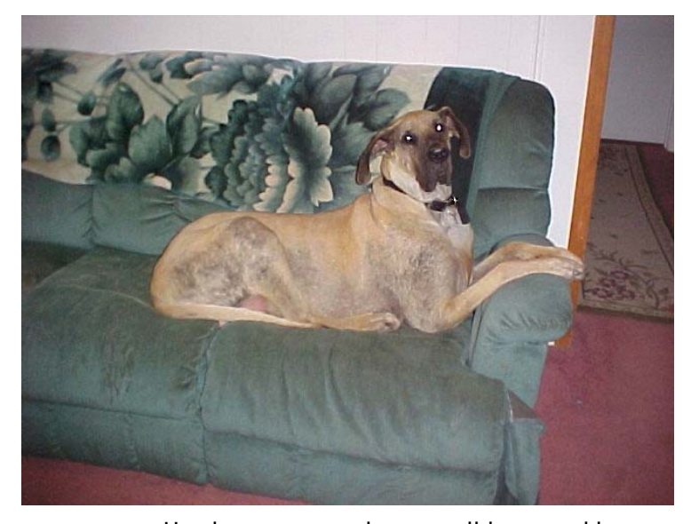
Handsome now, a dane we all know and love