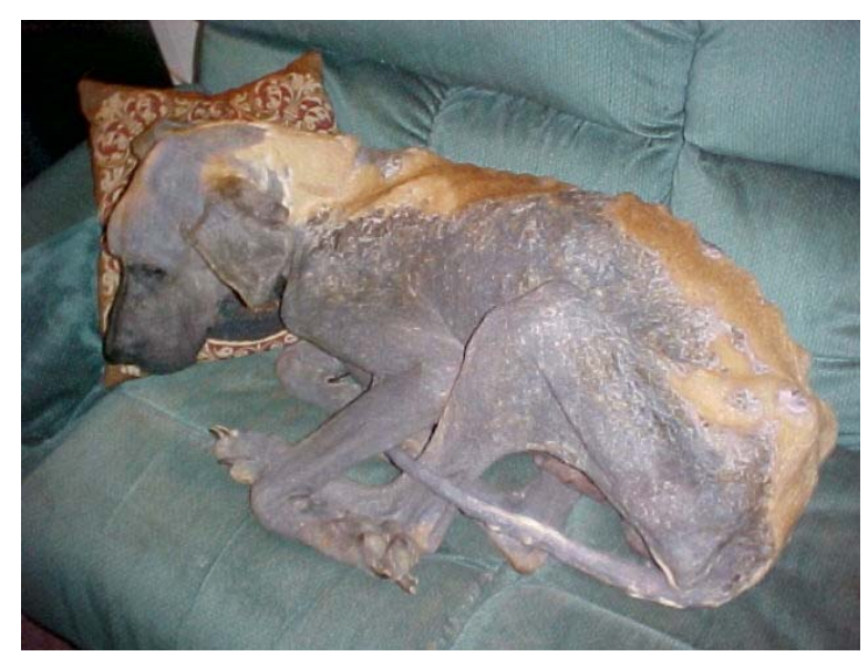
Handsome, as he came to us